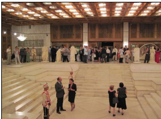
Reception at the National History Museum

exhibitions and receptions organised during the week, the highlight of which was the event at the National Museum of History, the former presidential palace, at which the current president addressed the assembled Byzantinists.