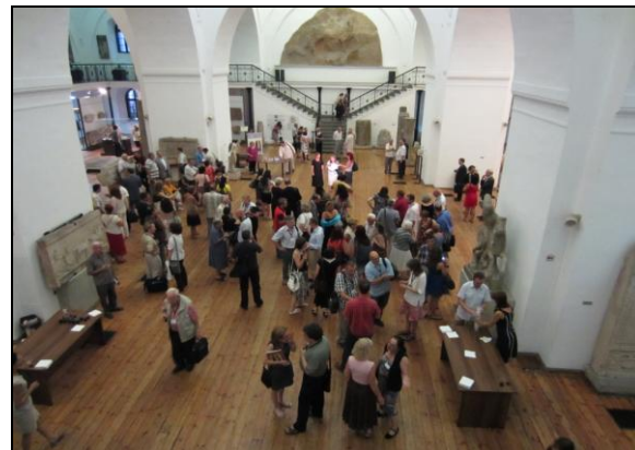
Reception at the Archaeological Museum

There were some one thousand people in attendance, many from Eastern Europe; by no means all those featured in the programme were present, as became clear when it became necessary for others to read out their papers. While the mornings were reserved for plenary sessions, the afternoons featured parallel sessions, with similar topics being grouped together each afternoon. This was frustrating, since it meant a large number of clashes, which could have been avoided. Nevertheless, the papers gave a good opportunity to meet fellow scholars, to make contacts, and of course to hear useful contributions on a wide range of topics. There were a number of