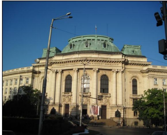
University St Kliment Ohridski

Since the programme of the conference can still be found on the web, it does not seem worthwhile to offer a blow-by-blow account of the many and varied sessions that took place through the week. Instead I shall offer a few impressions of the congress. The papers took place in the buildings of the university St Kliment Ohridski close to the city centre, within easy reach of many, if not all, hotels. The university rooms varied greatly in quality; some had recently been refurbished, others featured benches that might easily deposit the unwary on the floor, and others again were far too small for the sessions that had been scheduled there. The opening ceremony was packed; many had to stand. Throughout the conference the weather was hot and sunny, with the result that some rooms grew unbearably warm in the afternoon.